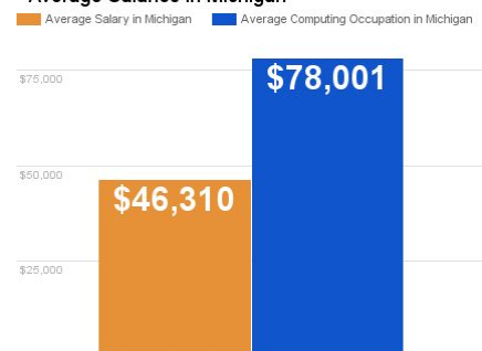
Average Salaries in Michigan

* All teachers attending the professional learning program must instruct an AP ® Computer Science Principles course in the Fall of 2017.